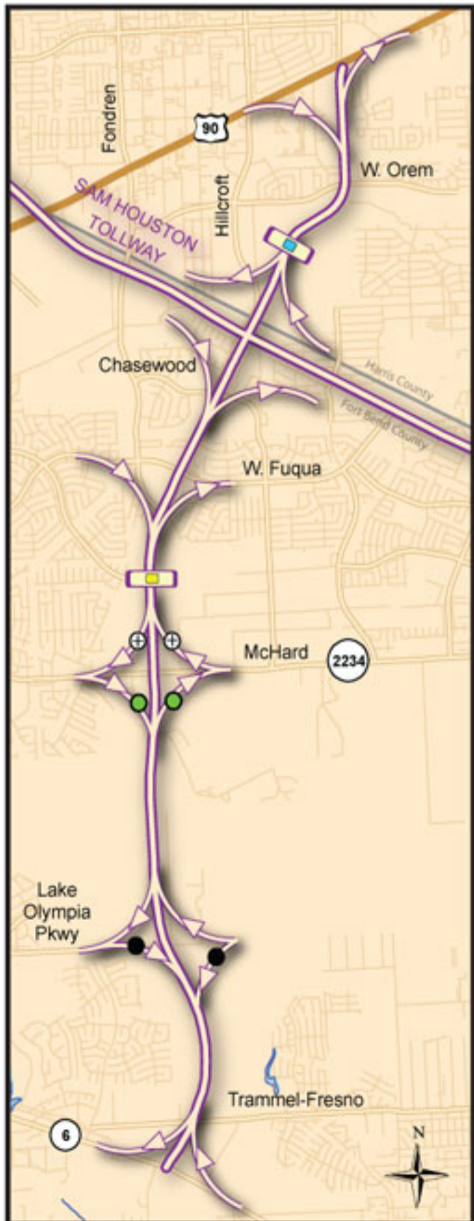
FORT BEND PARKWAY